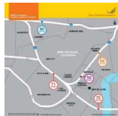
RWJF Commission City Maps: New Orleans, LA 16

The health, well-being, and equity of people and the places where they live, learn, work, play, and pray are interrelated and connected to the systems (e.g., policies, infrastructure) underlying both. For example, children born in the same hospital who grow up two miles apart might have a 10- to 25-year difference in predicted life expectancy 13, 14 because of place-based determinants of health. Health inequities appear to arise in part from a series of place-based historical and structural factors, such as redlining and zoning laws, which resulted in a lack of investment in places where communities of color frequently lived. 15 This meant that businesses could not get favorable loans and didn’t invest in these areas because they were perceived to be “risky.” Lack of business investment leads to fewer jobs, a poorer tax base, poorer schools, poor public and social services — a host of conditions that lead to poor health outcomes. This kind of structural inequity is detailed in a report from the Prevention Institute, “ Countering the Production of Health Inequities ,” which also surfaces potential actions that can be taken to move toward a more equitable culture of health.