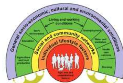
The Dahlgren-Whitehead Model 10

Social determinants of health, as defined by the World Health Organization, are “the conditions in which people are born, grow, live, work and age.” They may enhance or impede the ability of individuals to attain their desired level of health. 7 Social factors, such as racism, social isolation, violence, inadequate housing, and inadequate employment have a 50 percent higher contribution to poor health outcomes and premature death than health care access alone. 8,9 This is not meant to minimize the vital role of health care, but rather to underscore the profound contribution of social factors in the lifelong development of health and well-being. The County Health Rankings and Roadmaps model 11, 12 offers an example of the predicted impact of different factors (i.e., physical environment, social and economic, clinical care, health behaviors) on health and well-being. The model can be used to convey the influence that social determinants have on health outcomes. It also links to descriptions and statistics showing how different determinants contribute to health.