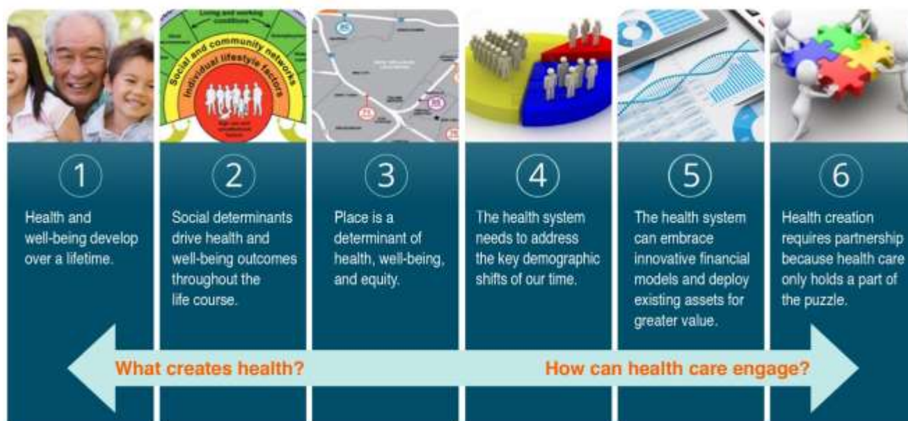
Figure 1. Six Foundational Concepts of Pathways to Population Health

The six concepts described below (also depicted in Figure 1) help lay the foundation for the Pathways to Population Health. They also articulate several reasons why many health care organizations have chosen to embark on this journey. The concepts represent an evolving understanding of what creates health and the ways in which health care organizations can engage.