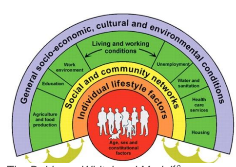
The Dahlgren-Whitehead Model<sup>10</sup>

Social determinants of health, as defined by the World Health Organization, are "the conditions in which people are born, grow, live, work and age." They may enhance or impede the ability of individuals to attain their desired level of health. Social factors, such as racism, social isolation, violence, inadequate housing, and inadequate employment have a 50 percent higher contribution to poor health outcomes and premature death than health care access alone.8,9 This is not meant to minimize the vital role of health care, but rather to underscore the profound contribution of social factors in the lifelong development of health and well-being. The County Health Rankings and Roadmaps model<sup>11, 12</sup> offers an example of the predicted impact of different factors (i.e., physical environment, social and economic, clinical care, health behaviors) on health and well-being. The model can be used to convey the influence that social determinants have on health outcomes. It also links to descriptions and statistics showing how different determinants contribute to health.