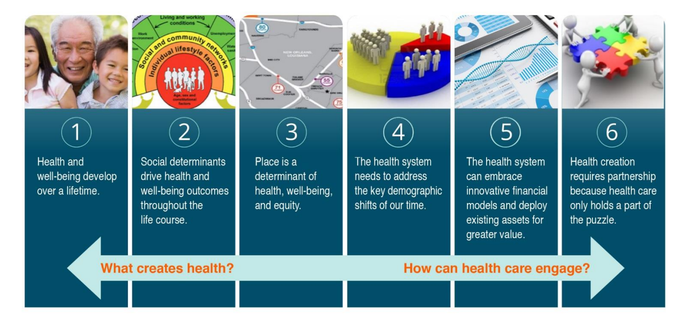
Figure 1. Six Foundational Concepts of Pathways to Population Health

The six concepts described below (also depicted in Figure 1) help lay the foundation for the Pathways to Population Health. They also articulate several reasons why many health care organizations have chosen to embark on this journey. The concepts represent an evolving understanding of what creates health and the ways in which health care organizations can engage.