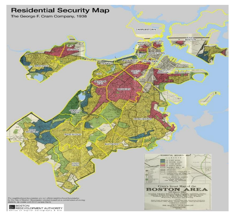
Figure 2. Boston Residential Security Map of 1938

The effects of these racist policies are still felt in Boston and all other major US cities today. Brigham and Women's Hospital Department of Medicine and Southern Jamaica Plain Health Center, both located in one of these historically "redlined" Boston-area neighborhoods, know that access to transportation, health care, food, housing, and education all effect a person's health. These health care organizations are thus working to deepen their partnership with key organizations and leaders in these communities to help citizens directly affected by these policies achieve their full health potential.