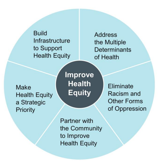
Figure 1. IHI Framework for Health Care Organizations to Improve Health Equity

In April 2017 the Institute for Healthcare Improvement (IHI) launched the two-year Pursuing Equity initiative to learn alongside eight US health care delivery systems that are working to improve equity at their organizations. The five-component framework presented in the IHI White Paper, Achieving Health Equity: A Guide for Health Care Organizations , serves as the initiative's theory for how health care organizations can improve health equity. IHI continues to update and refine this theory based on learning in the initiative and the experience of the eight organizations; for example, we have updated some terminology in the original framework to reflect additional learning and clarity (see Figure 1).