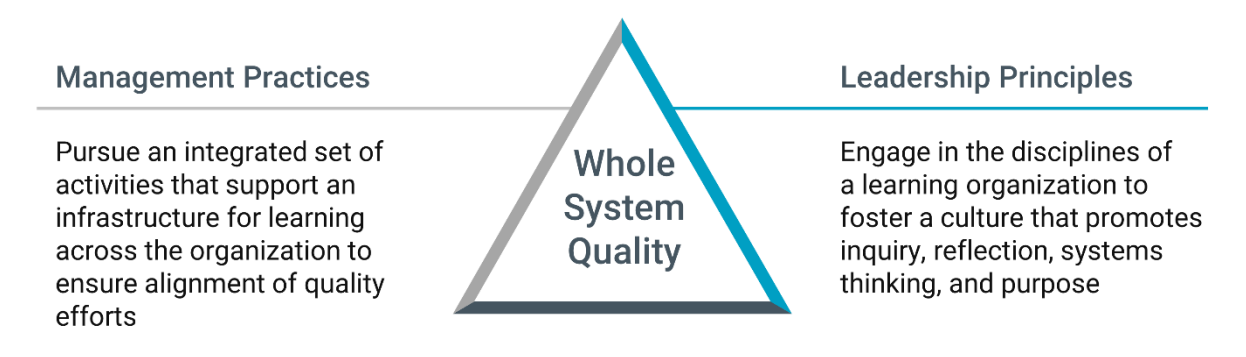
Figure 2. Whole System Quality Practices and Principles

• Whole system quality comprises integrated quality planning, quality control, and quality improvement activities that inform an organization-wide, interlinked, and customer-centric strategic approach to quality.