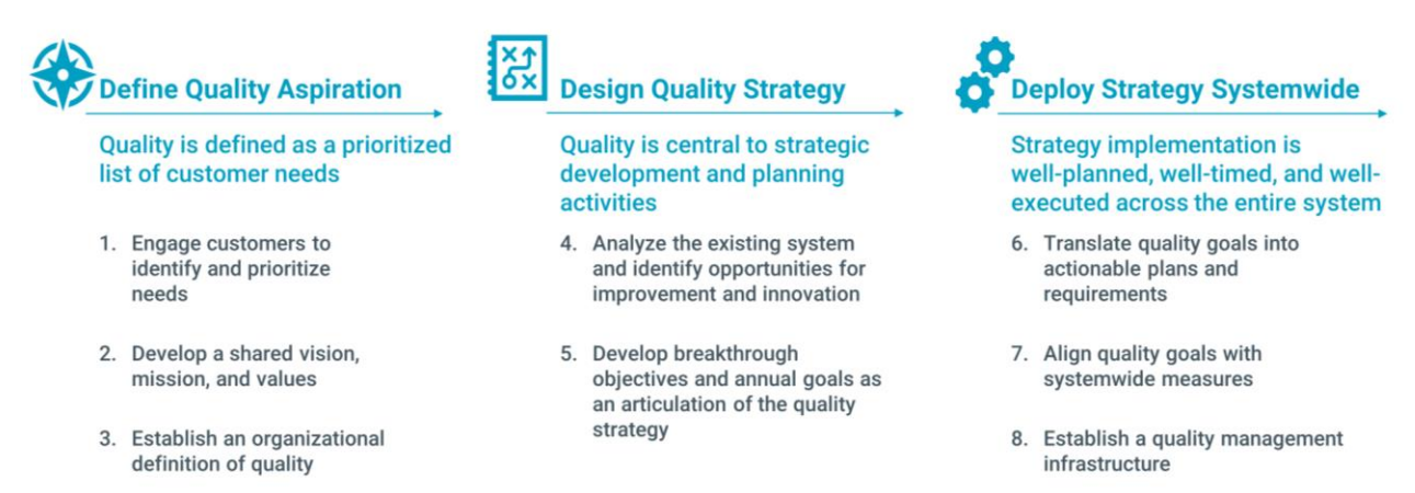
Figure 5. A Sequenced Approach to Quality Planning

The quality planning process shown in Figure 5 seeks to respond to each gap using a systematic and sequenced approach, with specific processes outlined for each phase of the QP process. The steps are intentionally numbered to follow the defined sequence.