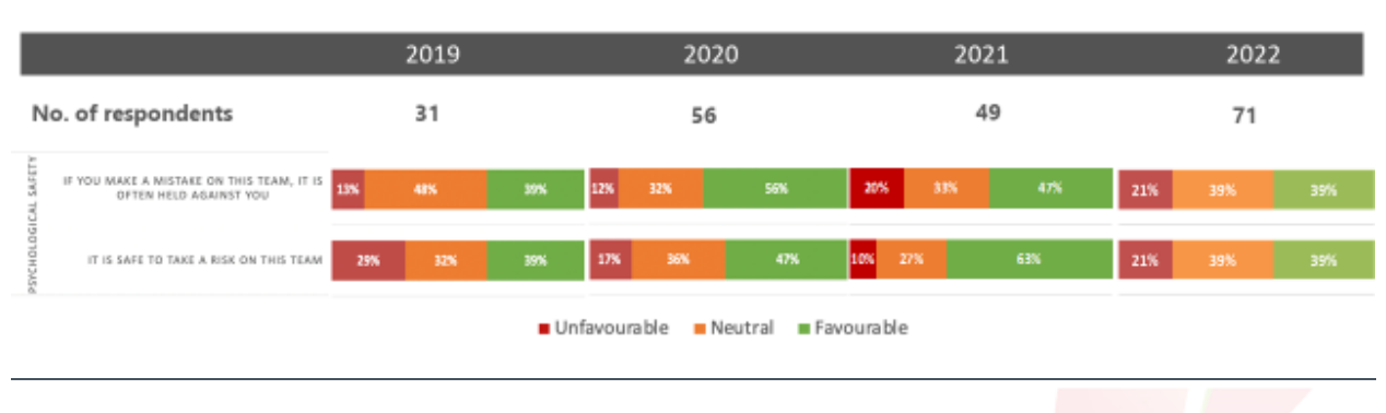
Figure 4. Rehabilitation Team Joy in Work Pulse Survey Results on Psychological Safety (2019–2022)

Woodlands Health noted that while the larger Allied Health Rehabilitation team saw an exponential increase in team membership since its formation, the team was able to maintain a consistent level of psychological safety as measured by the joy in work pulse survey data collected over four years (see Figure 4).