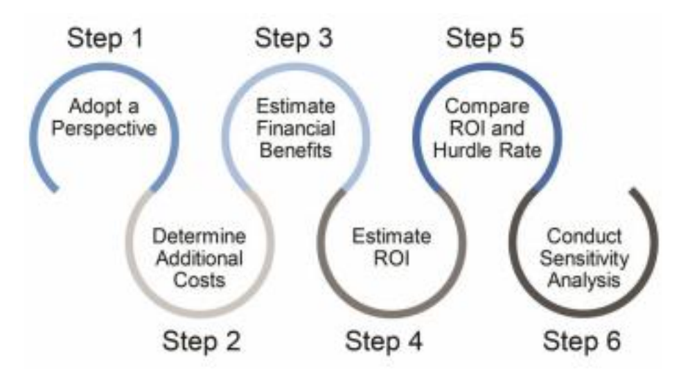
Step 1: Adopt a Perspective

The first step is to determine whose costs and whose financial benefits to consider. While the 4Ms may generate financial gains for a variety of stakeholders, only the financial consequences for the investing party (i.e., the health care organization making the investment) count in this analysis.