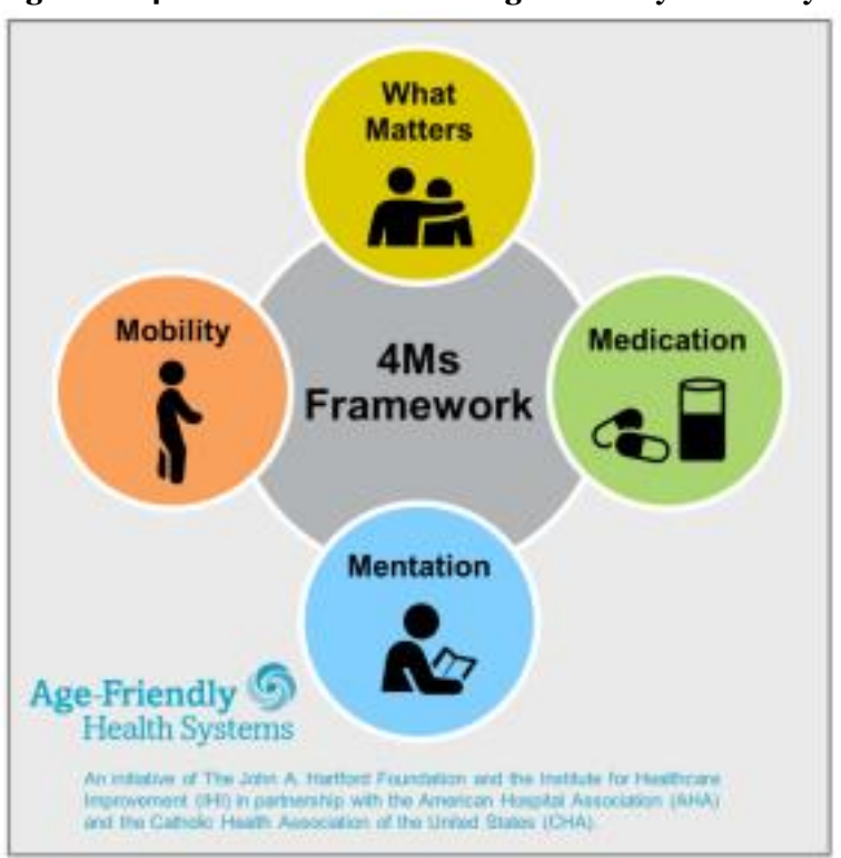
Figure 1. "4Ms" Framework of an Age-Friendly Health System

For pergrap word, this gargetic that his enter in its enterty without requesting permanents. Gargetian Sies and publishmen at this ony Agent servity.