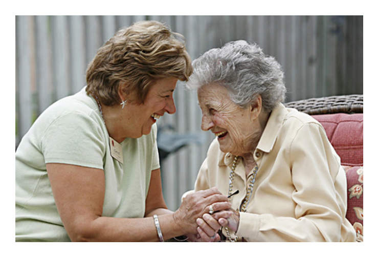
The National Council on Aging piloted the Well-Being Assessment among older adults, then adapted it based on their feedback.

NCOA then created a toolkit to help its partners in the 100MLives Aging Hub, as well senior centers and other community providers, use the Well-Being Assessment Tailored for Older Adults to measure whether their services are meeting seniors' needs and take steps to address shortfalls. The Baltimore County Department on Aging (BCDA) has fielded thousands of assessments and made changes at its 20 senior centers based on results: adding more opportunities to exercise and socialize in places where low scores pointed to those gaps. And as the coronavirus spread this spring, the BCDA used the assessment data to prioritize which seniors seemed most vulnerable and should therefore receive the first reassurance calls, reaching out to offer virtual programs, food deliveries, and referrals to other social services.