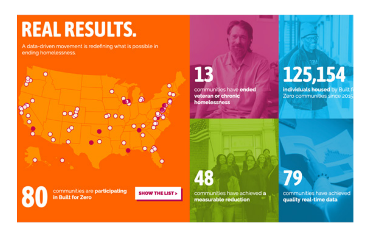
Graphic: Community Solutions

Housing groups from across the US are working to end chronic homelessness in a campaign known as Built for Zero that relies on having real-time data on people living in the streets or shelters.