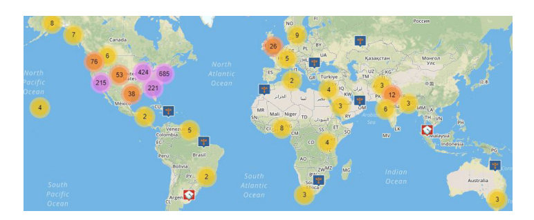
100 Million Healthier Lives is made up of change agents from across the globe.