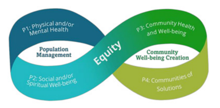
The Pathways to Population Health Framework helps health systems identify practical strategies for improving the health of individuals and communities.

practical strategies to put what may seem an abstract concept into action.<sup>8</sup> They also developed the Pathways to Population Health Compass, a tool health care organizations can use to assess their progress in expanding their focus – from the health of their patients to the health and wellbeing of populations and communities.<sup>9</sup> Users assess their progress in areas such as financing, stewardship, equity, and partnering with people with lived experience.